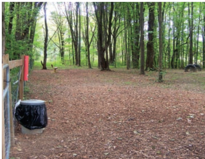
Our Doggie Playground